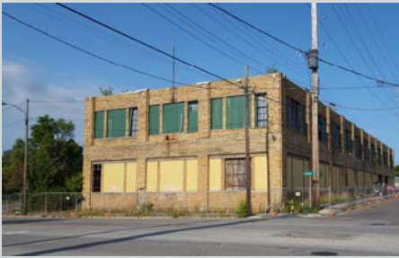
1425 N Saginaw—Before