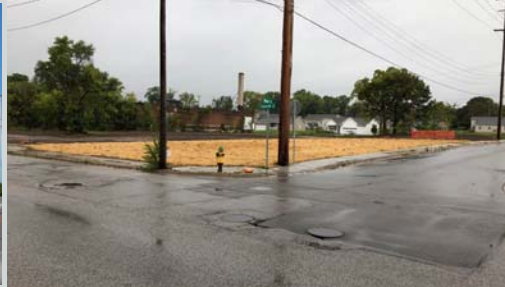
1425 N Saginaw—After