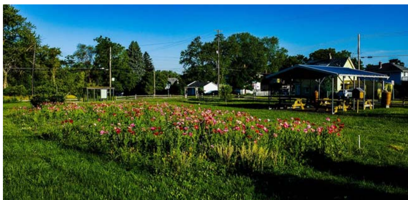
1423 & 1425 Maplewood—After