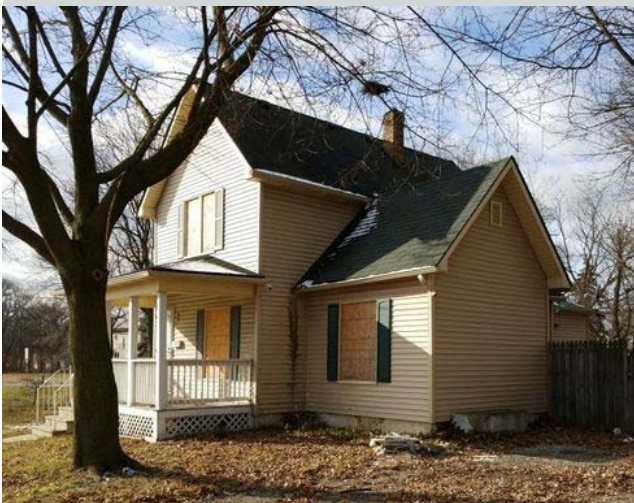
Featured Home: 326 W. Eighth St., Flint

We are now showing Featured Homes by appointment only due to COVID-19. To see the current list of Featured Homes, click here . Call to schedule an appointment to view each home you are interested in. Please make your appointment before the showing date and arrive on time. We are not able to schedule appointments after 12pm on the showing date.