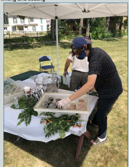
Community Picnic Passing Out Drinks