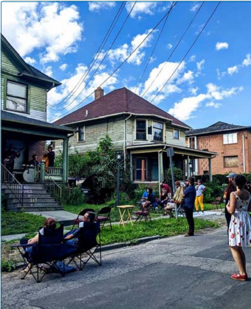
Porch Fest performance