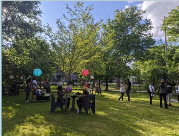
Porch Fest reusing vacant lots for poetry writing and seating