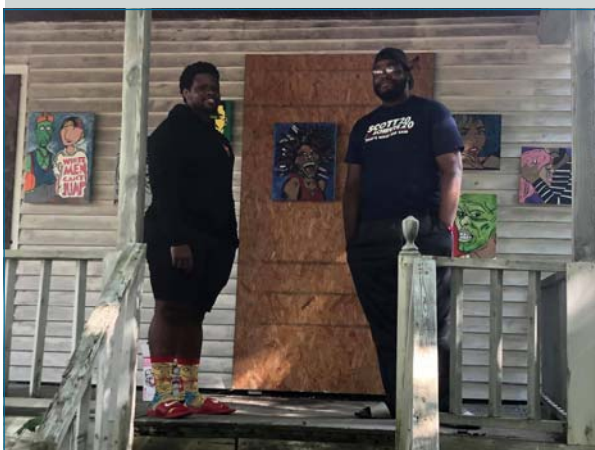
Porch Fest pop-up art show