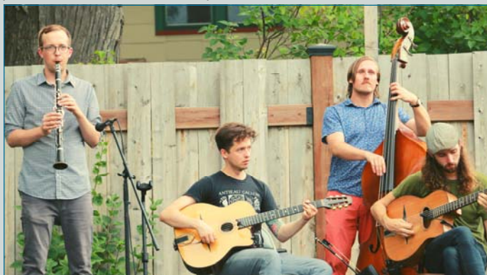
University Square Community Picnic Band Performance