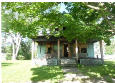
1423 Maplewood Before