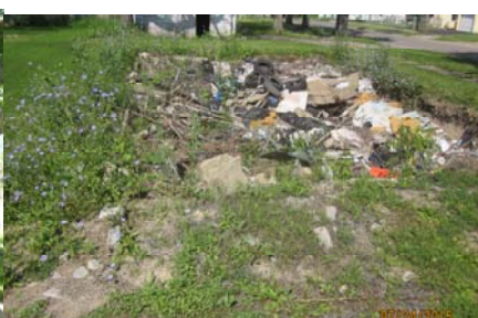
1425 Maplewood Before