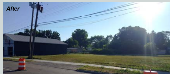
Number and Type of Demolitions By Local Unit