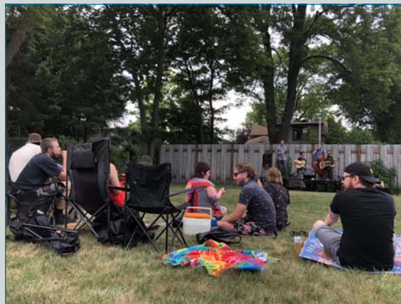
Porch Fest reusing vacant lots for poetry writing and seating