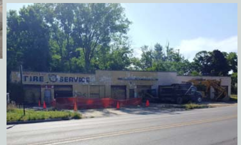
1604 M L King Avenue—EGLE Investigation