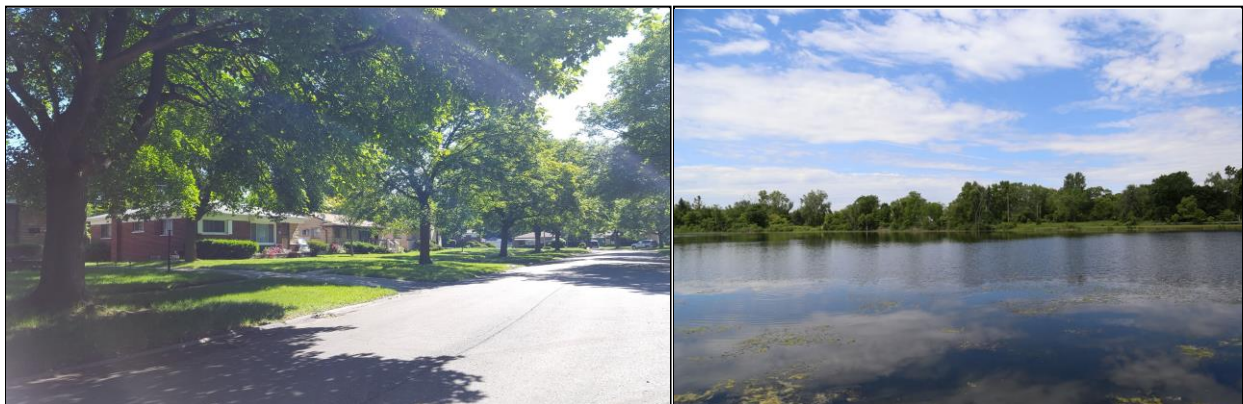
Nearby: The neighborhood (left) immediately north of the site. Flint Lake Park (right), a half mile east.

The site has a WalkScore of 65. This score may rise as the North Flint Food Market and Hamady Brothers Grocery (in Hallwood Plaza, just west of Clio Road) open.