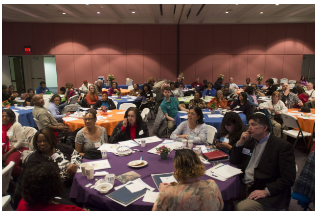
Above: Connect the Blocks Neighborhood Summit

The Land Bank and the City of Flint presented the Portal to community members for feedback in the winter and spring of 2017, before the Portal was launched live. This included presentations to residents, community-based groups, and local institutions, as detailed on page 3. The Portal was revised in response to feedback given during these events. Then, the Land Bank and the City of Flint launched the Portal live in the summer of 2017 with a series of community launch events held throughout Flint. Land Bank and City of Flint staff continue to attend community meetings on an ongoing basis to share information on the Portal, distribute user guides, and help residents to download the app and use the website to support neighborhood improvement work.