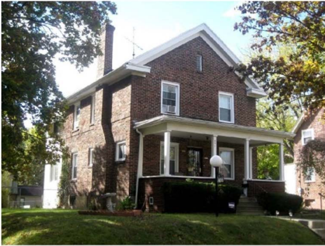
Paterson Street Historic District: 801 W. Paterson St. Both individually eligible for the NRHP and a contributor to a newly delineated historic district of five single family properties along Paterson Avenue.