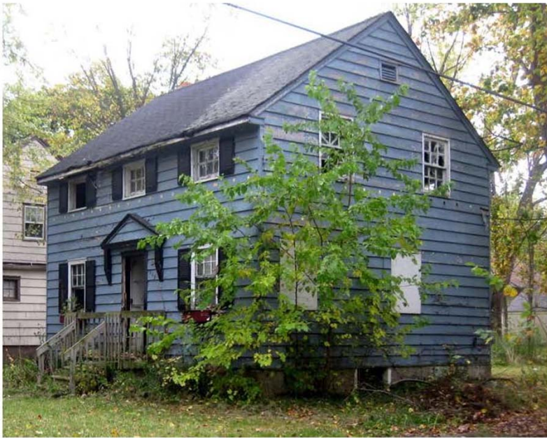
909 W. Rankin St.