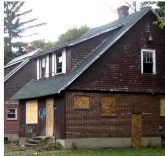
2321 Forest Hill Ave. Insensitive porch enclosure with T1-11 type siding at the front elevation.