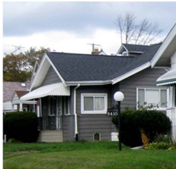
2414 Bassett Pl. New siding that appears to be synthetic or metal; vinyl or metal frame windows, elevated entry appears compromised with new materials.