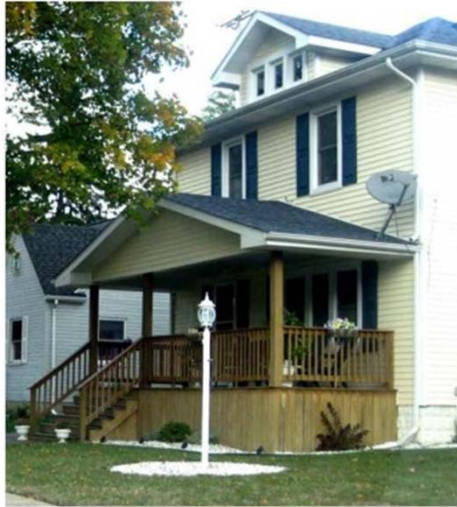
1906 Lloyd St. Porch appears to be reconstructed; boxed eaves appear to be more recent.