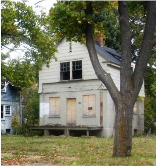
2638 Lawndale Avenue. Missing porch, missing steps, missing fenestration and door.