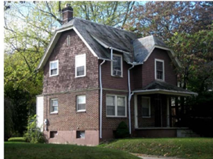
Paterson Street Historic District: 805 W. Paterson St. Contributor to a newly delineated historic district.