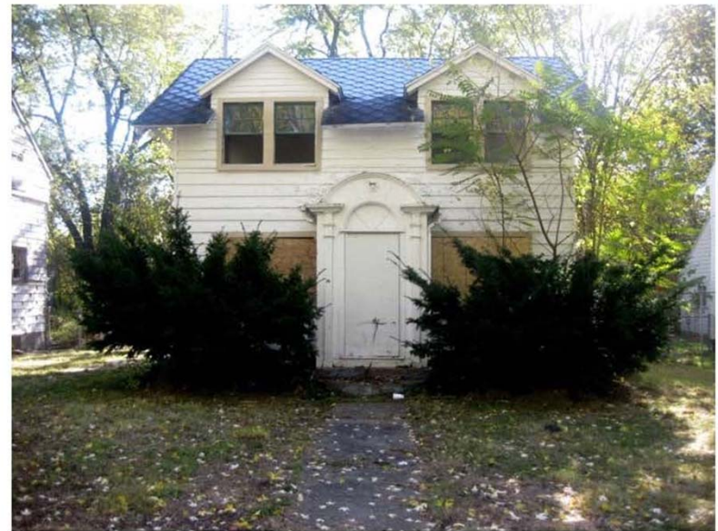
1732 Milbourne Ave.