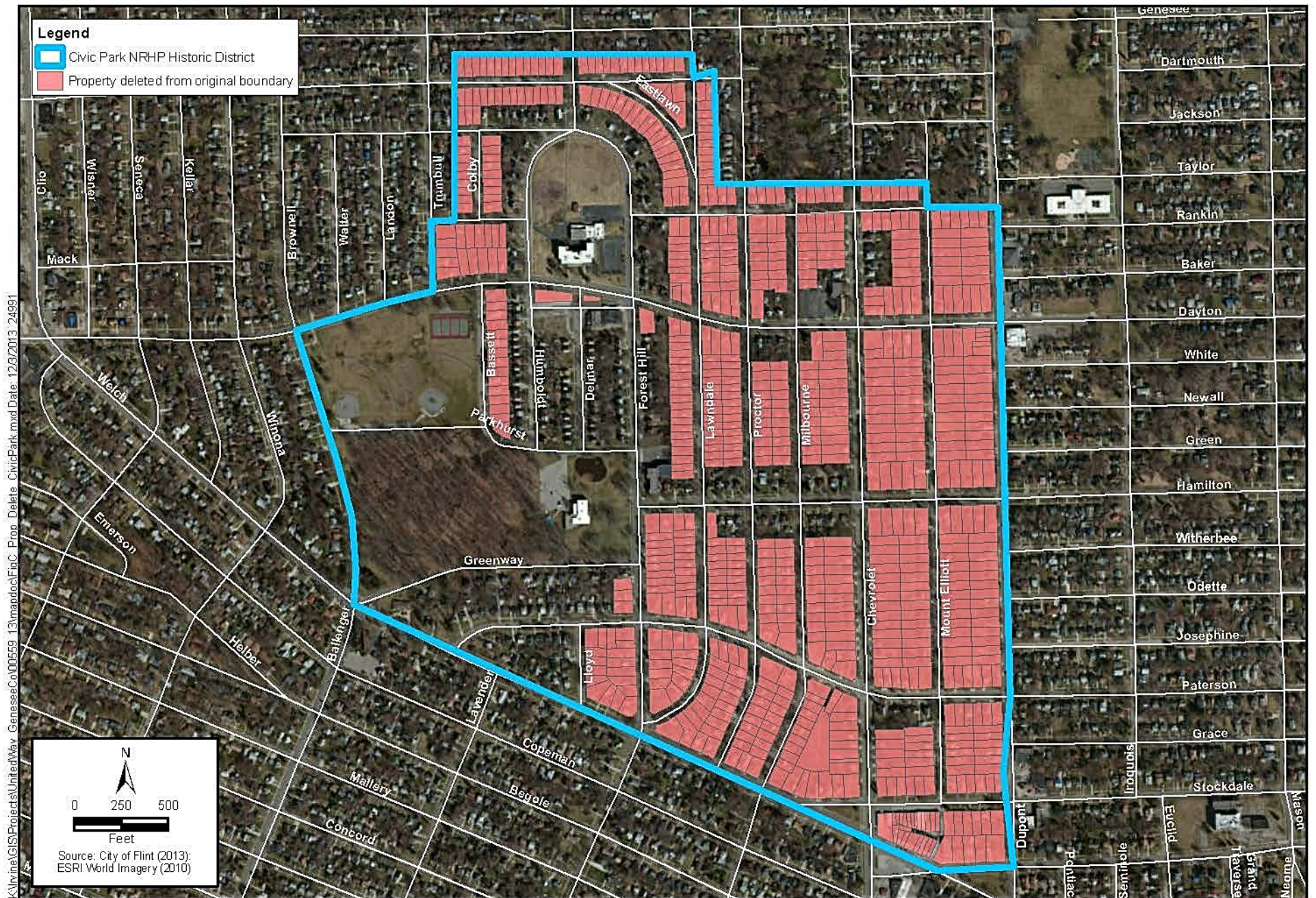
Figure C Properties Deleted from Civic Park Historic Residential District