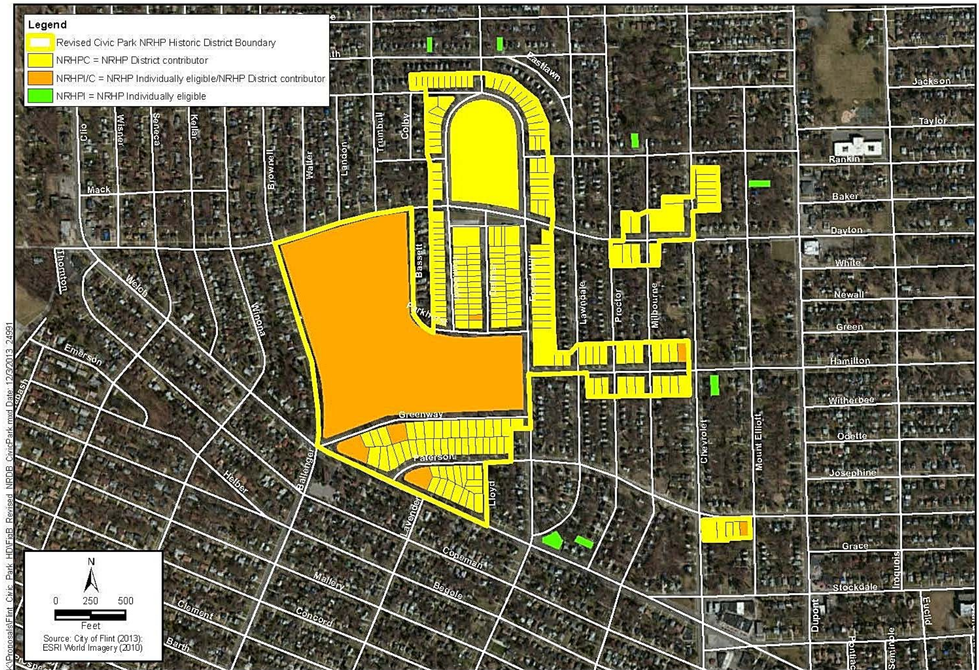
Figure B Revised National Register District Boundaries and Individually Eligible Properties