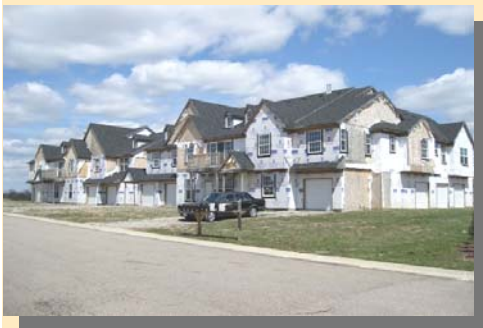
1115 Hunters Run Dr Grand Blanc Township Minimum Bid: $37,838.90 13 Lots - Partially Built Condos