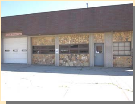
2926 Robert T Longway Blvd City of Flint Minimum Bid: $26,366.45