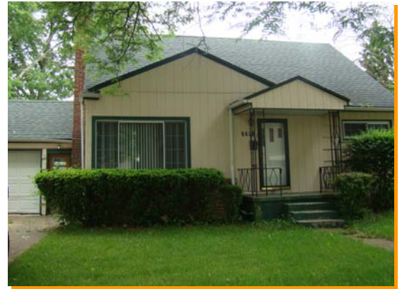
2716 Golfside (Before)

Mott Park remains one of Flint's nicest neighborhoods and we hope that these rehabs, in addition to others that will be done with Federal Neighborhood Stabilization Funds (NSP2) will help the neighborhood continue to thrive. Bids were recently opened and contracts signed with work now getting underway. The project is expected to be completed in August and the homes will be listed with realtors who work with the Land Bank.