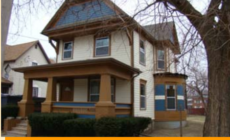
818 Lyon Street

On Saturday, April 21, 2012 the Genesee County Land Bank and City of Flint held a Home Tour of newly renovated homes in the Carriage Town Historic Neighborhood and the New Smith Village. The event featured 612 W University Ave, 818 Lyon St, 426 W First Ave in Carriage Town and 517, 521 and 557 Williams St in Smith Village. The community was invited to walk through the homes and talk with realtors about how homeownership can become a reality, for as little as $1,000 down.