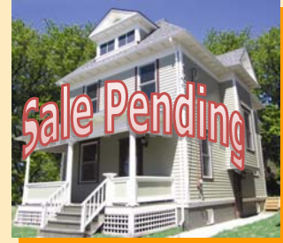
612 University Avenue