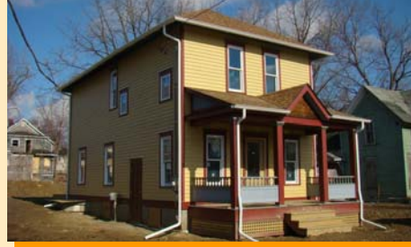
426 W. First Avenue

Theresa Allen Royal Realty 810-732-9210 Listed at: $41,900